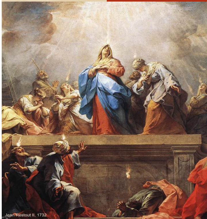
Jean Restout II, 1732